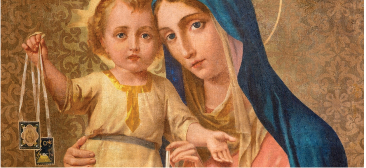
Our Lady of Mount Carmel, Feast Day July 16th

10 Washburn Way, Scarborough, ON, M1B1H3 | Tel: 416-298-0989 | Fax: 416-298-8959 Email: StBarnabasSC@archtoronto.org | Website: https://stbarnabasto.ca | Social Media: @stbarnabasto